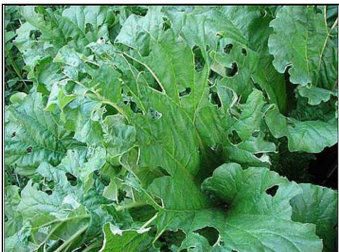
Figure 3: Rhubarb damage from large yellow underwing

These particular caterpillars overwinter as immatures, and will come out for lunch during mild spells. At my place, I found a half-grown larva in January. (It gave its life for science and now will do service in the hands-on exercise during our annual Entomology training!)