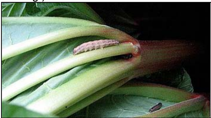
Figure 4: Caterpillar of the large yellow underwing

These particular caterpillars overwinter as immatures, and will come out for lunch during mild spells. At my place, I found a half-grown larva in January. (It gave its life for science and now will do service in the hands-on exercise during our annual Entomology training!)