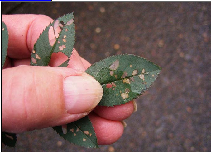
Figure 2: Damage from rose slug

In home gardens, leaf damage from rose slug is recognized more often than the small greenish critters which cause it. Damage in home gardens is often minimal and typically unnoticed until the critters are long gone. (See Figure 2, also http://oregonstate.edu/dept/nurspest/roslug.htm )